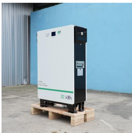
Turkmenistan Energy Storage Market (2025-2031) , Value